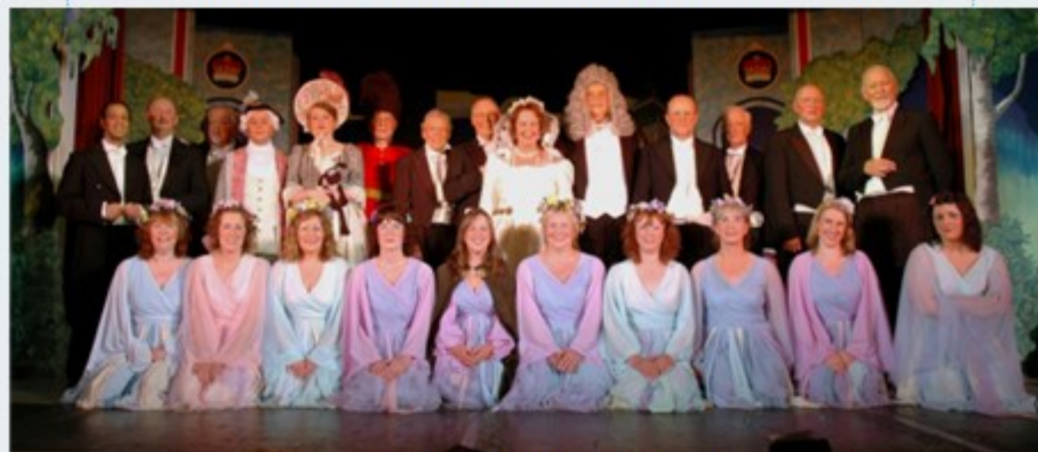
Our last production of Iolanthe was in 2011.